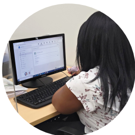
Administration & Clerical

When the job market rapidly reopened and expanded over the last year, we recognized its impact on our community. Employers needed trained people quickly, and our skills training programs filled that urgent gap. Our 8 to 12-week condensed skills training programs gave participants the hands-on practical experience, professional skills and certifications required in growing industries, such as warehouse and manufacturing, commercial and residential construction, commercial cleaning and administrative positions.