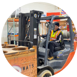
Logistics & Manufacturing