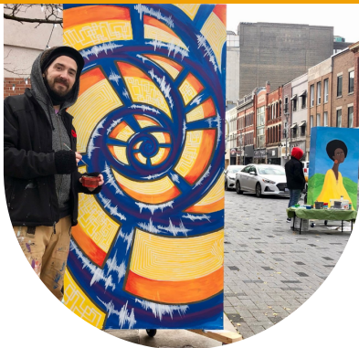
Portable murals created for the London Arts Council

Clean Works hires graduates of the Property Maintenance Training program through Pathways as a step along their employment journey.